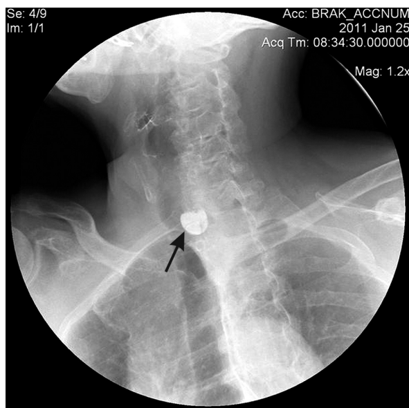
Figure 2. Oesophageal barium study demonstrating a 2-cm Zenker's diverticulum (arrow) at the level of Th1, filled with contrast medium