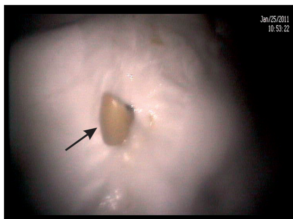
Figure 4. View of the removed prosthesis (arrow)

quest with no premedication) a small ZD and a foreign body present in its lumen were revealed: a single-tooth denture (Figure 3). A successful attempt to remove it using a Dormia basket was carried out (Figure 4). The course of the procedure was without complication. During the following 6-month follow-up the patient has not suffered from aggravation of symptoms and has not decided on definite treatment yet.